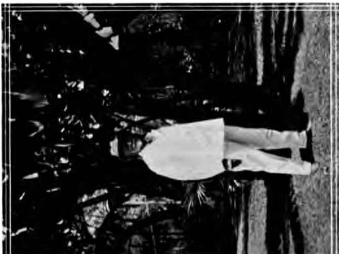
IN HAWAII, 1914